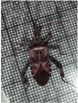
Western conifer Seed Bug Holt 2018