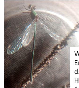
Willow Emerald damselfly Holt Hall 2019