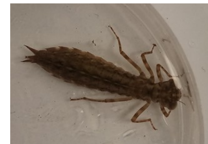
Hawker Dragonfly Nymph Holt Hall lake 2019